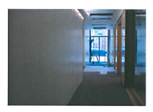
MAIN GROUND FLOOR CORRIDOR TO Nos. 22-26 STANNARY STREET LOOKING NORTH TOWARDS STANNARY STREET