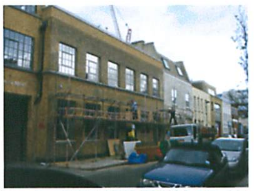
REAR ELEVATIONS TO NOS. 20 – 26 STANNARY STREET LOOKING SOUTH