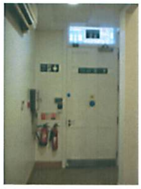
REAR ACCESS FROM STANNARY STREET INTO NO. 20 STANNARY STREET

184 KENNINGTON PARK ROAD, LONDON SE11 4BU 20 STANNARY STREET, LONDON SE11 4AA AND 22-26 STANNARY STREET, LONDON SE11 4AA