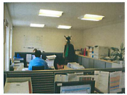
QUALITY OF OFFICE SPACE

184 KENNINGTON PARK ROAD, LONDON SE11 4BU 20 STANNARY STREET, LONDON SE11 4AA AND 22-26 STANNARY STREET, LONDON SE11 4AA