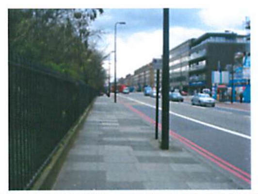
STREET SCENE LOOKING SOUTH WEST