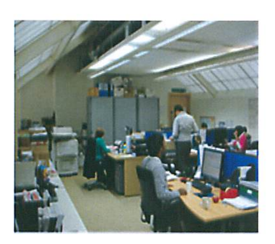
MEZZANINE OFFICE AREA