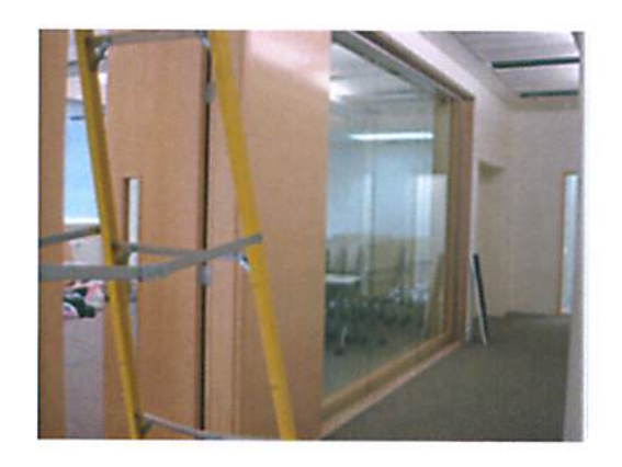
GENERAL VIEW OF GROUND FLOOR OFFICE TRIBUNAL ROOMS/OFFICES