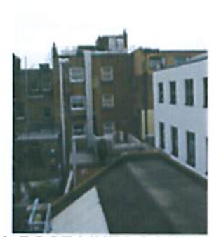
GENERAL ROOF LINE LOOKING EAST FROM NO. 20 STANNARY STREET