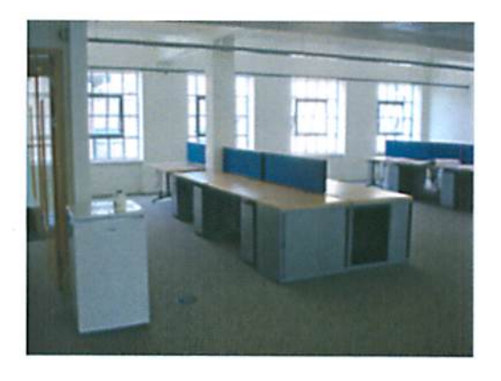
QUALITY OF FIRST FLOOR OFFICE SPACE