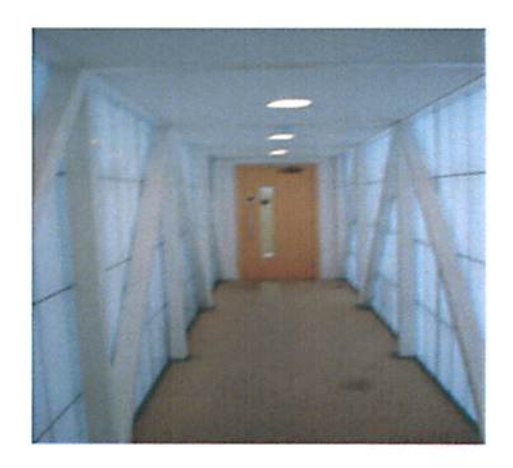
BRIDGE BETWEEN KENNINGTON PARK ROAD AND STANNARY STREET