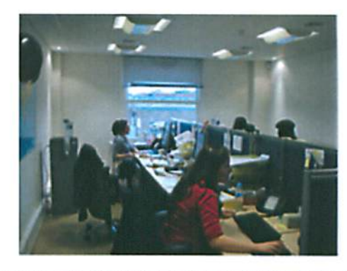
QUALITY OF OFFICE SPACE TO UPPER FLOORS OF NO. 184