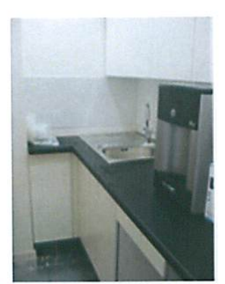
SMALL ANCILLARY KITCHENETTE TO FIRST FLOOR

184 KENNINGTON PARK ROAD, LONDON SE11 4BU 20 STANNARY STREET, LONDON SE11 4AA AND 22-26 STANNARY STREET, LONDON SE11 4AA