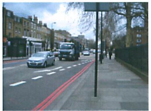
STREET SCENE LOOKING NORTH EAST