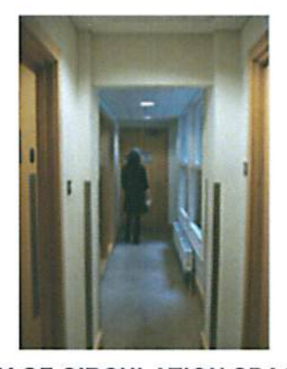
QUALITY OF CIRCULATION SPACE WITHIN BUILDING