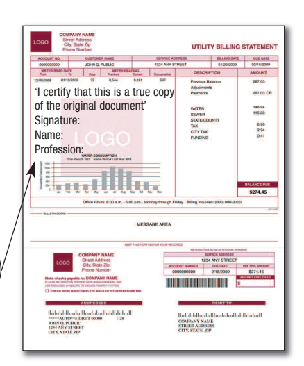
One document proving your current address

Certification of photocopied documents must be done in the format as shown on these examples. Certification can be done on the front or back of each photocopied document. All certification signatures must be original signatures.