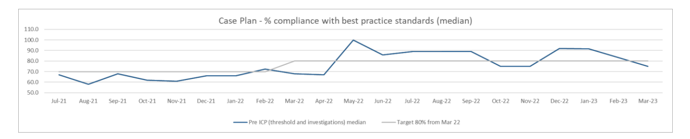
Figure 3 – quality of case planning: performance against target

2.9. As above, additional coaching, support and oversight is being provided to newer and less experienced Case Managers to ensure that we again achieve and maintain our performance at or above our 80% target.