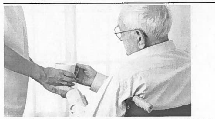
When care takes place in people's own homes, risks are magnified.

Without workforce regulation, the potential for poor care to remain hidden is enormous